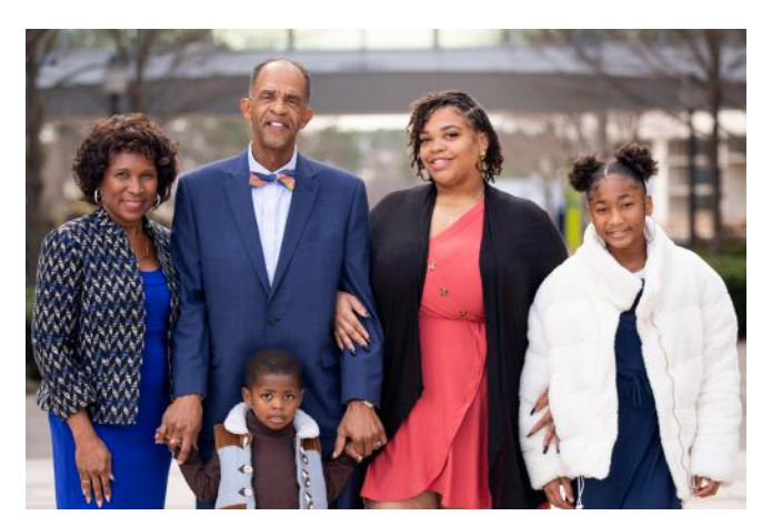
Duke Cancer Institute provides a variety of support services and resources for the entire family.

Duke Health provides a variety of outpatient physical and occupational therapy services. Services include assessments and treatments for the following conditions: general weakness and deconditioning, chronic pain, changes in cognition, impairment with fine motor dexterity, alterations in vision, incontinence and sexual health issues. Specialized programs are also offered, including lymphedema management, falls risk assessments, functional capacity evaluations, driving evaluations, wheelchair seating evaluations, facial paralysis and pelvic floor rehabilitation. To schedule an appointment or to seek further information regarding our programs, please call 919-684-2445.