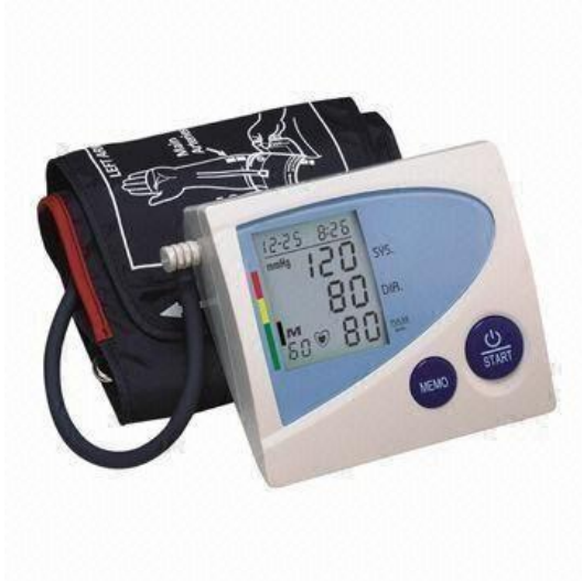
Mytech® Technology Co., Ltd.